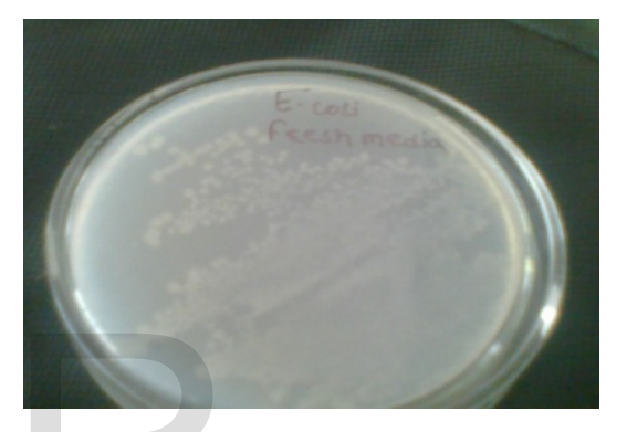
Figure 3: Fresh Media Plate E.coli