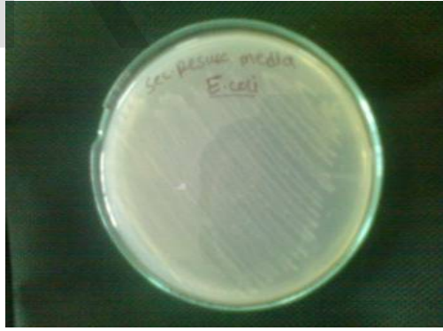
Figure-4: Second day media Plate E.coli