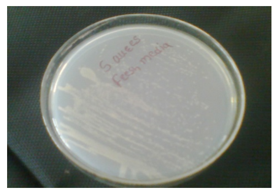
Figure 2: Fresh Media plate S.aureus

Without addition of any nutrition plates of second and third day showing good growth. Some inhibitory metabolic product need to purify to grow bacteria in natural condition. Size of colonies is different in the all recycled plates due to inhibitory or essential trace element which is consumed in the first growth. Analysis of purity is major in way to recycle the media as fresh. Question arising about the purity or porosity of agar which gets decreased after the remelting.